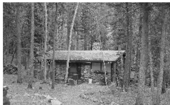
Figure 1 Cabin in the Forest: Arapahoe-Roosevelt NF.

All of the cabins are in a forest setting with less than half (44%) sited on river/stream frontage. Only forty-four per cent are winterised and about two-thirds (77%) have gravel, graded road access both of which likely limits winter use in the rather frigid, snowy mountains of Colorado. Grid electricity is connected to about half (48%) of the cabins but wood-burning stoves are the most prevalent form of heating, as is bottled gas for cooking. Just over half (52%) use creek water, about a quarter (24%) carry water in and the remainder use springs or are connected to a community water supply. Seventy per cent have an outhouse, 15 per cent have flush toilets and composting or chemical toilets make up the rest. It is evident that, even in this small sample, the cabins have a wide range of facilities. However, the general level of facilities suggests that they are probably best described as 'rustic' rather than 'primitive' (Figure 1).