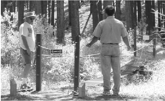
Figure 3. Cabin Project: Footbridge on a Small Creek.

‘become a better listener’; ‘learn Spanish’ (Figure 3). The individual projects were classified into twelve broad categories (Figure 4) to facilitate comparisons across contexts (home/cabin) and between different studies.