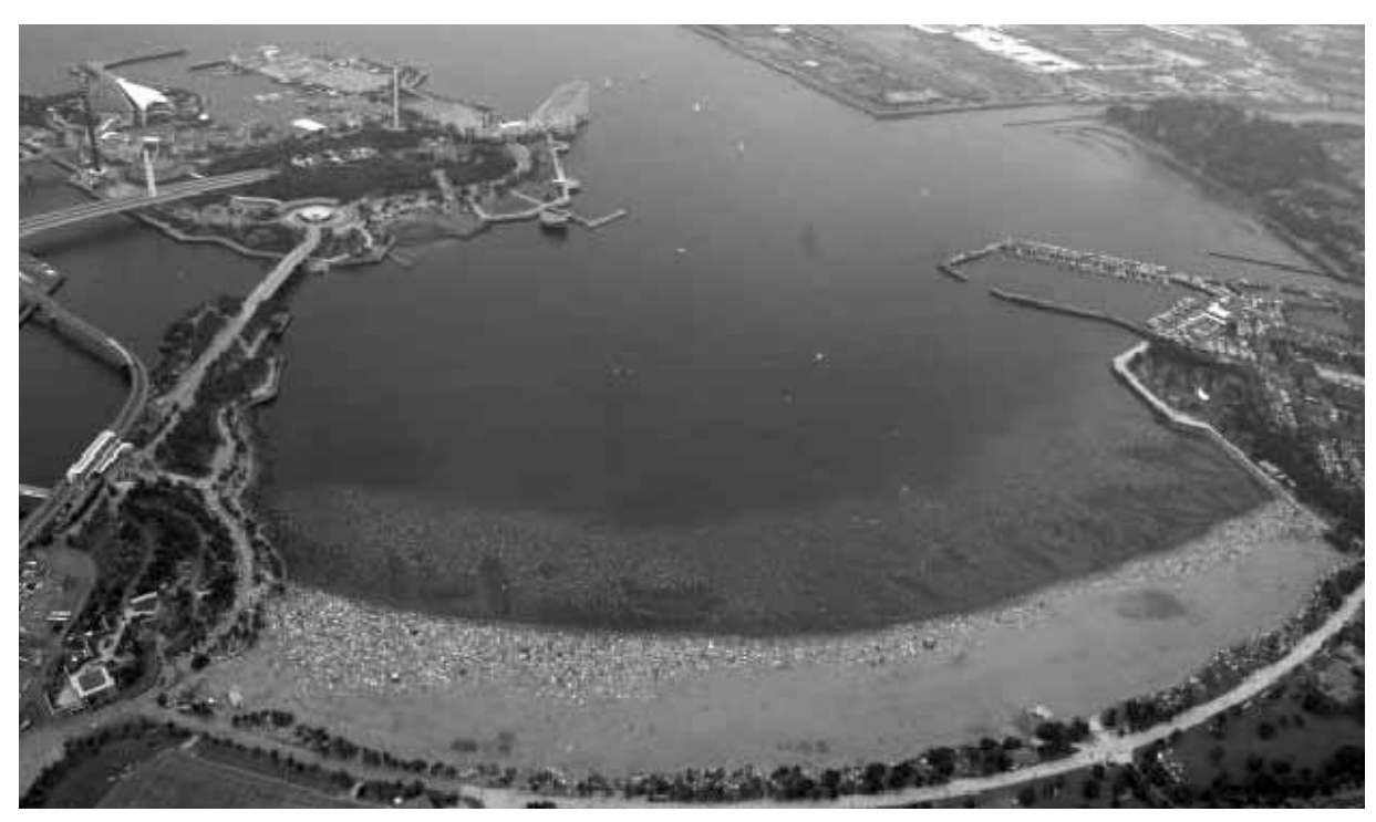
Figure 5: Aerial photo which was taken at low tide in May 8, 2005