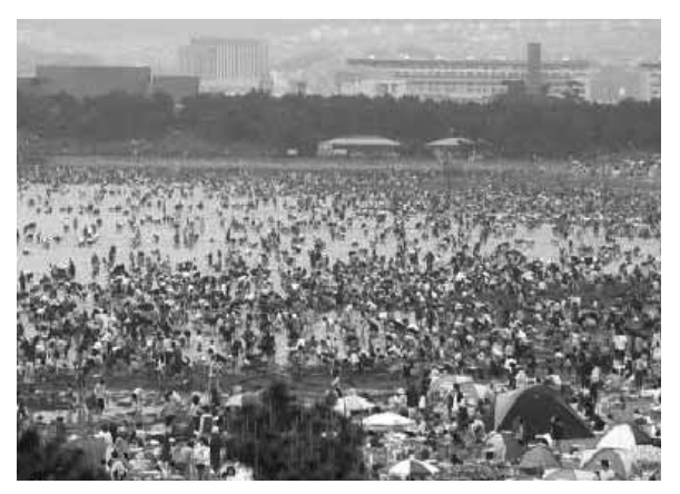
Figure 2: Photograph of the shellfish-gathering in the Uminokouen at 9:56 May 8, 2005, which was taken from point-B shown in Figure 1.

clam resources have recovered naturally so far. However, there is a possibility that destruction of natural clam resources will occur if such shellfish-gathering is continued. Therefore, it is necessary to quantify the visitor impact of the shellfish-gathering to the clam resources.