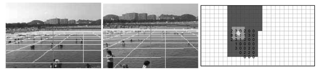
(d) at 15:00

Figure 4: Video pictures by two video cameras with the converted grid, and the diagram of counted heads and the observed shore line at every grid cell.