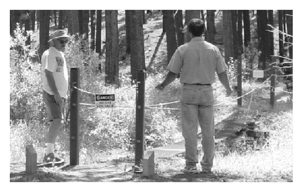
Figure 3. Cabin Project: Footbridge on a Small Creek.

'become a better listener'; 'learn Spanish' (Figure 3). The individual projects were classified into twelve broad categories (Figure 4) to facilitate comparisons across contexts (home/cabin) and between different studies.