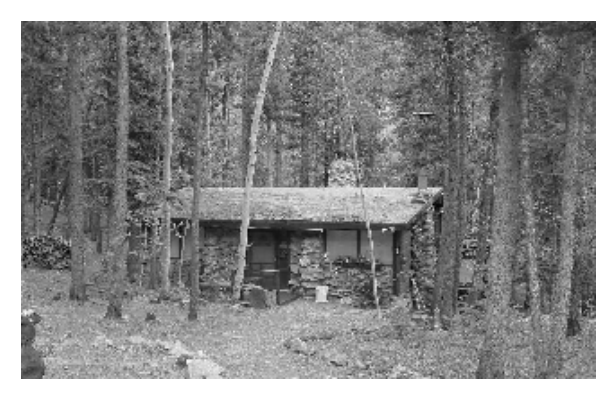
Figure 1 Cabin in the Forest: Arapahoe-Roosevelt

All of the cabins are in a forest setting with less than half (44%) sited on river/stream frontage. Only fortyfour per cent are winterised and about two-thirds (77%) have gravel, graded road access both of which likely limits winter use in the rather frigid, snowy mountains of Colorado. Grid electricity is connected to about half (48%) of the cabins but wood-burning stoves are the most prevalent form of heating, as is bottled gas for cooking. Just over half (52%) use creek water, about a quarter (24%) carry water in and the remainder use springs or are connected to a community water supply. Seventy per cent have an outhouse, 15 per cent have flush toilets and composting or chemical toilets make up the rest. It is evident that, even in this small sample, the cabins have a wide range of facilities. However, the general level of facilities suggests that they are probably best described as 'rustic' rather than 'primitive' (Figure 1).