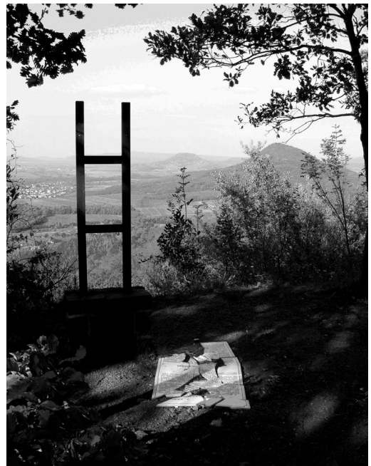
Fig. 2. Traces of vandalism along the study trail on the hill of Badacsony

Importance of environmental education is well known in Hungary today. Therefore, it is important to take measures as soon as pos-